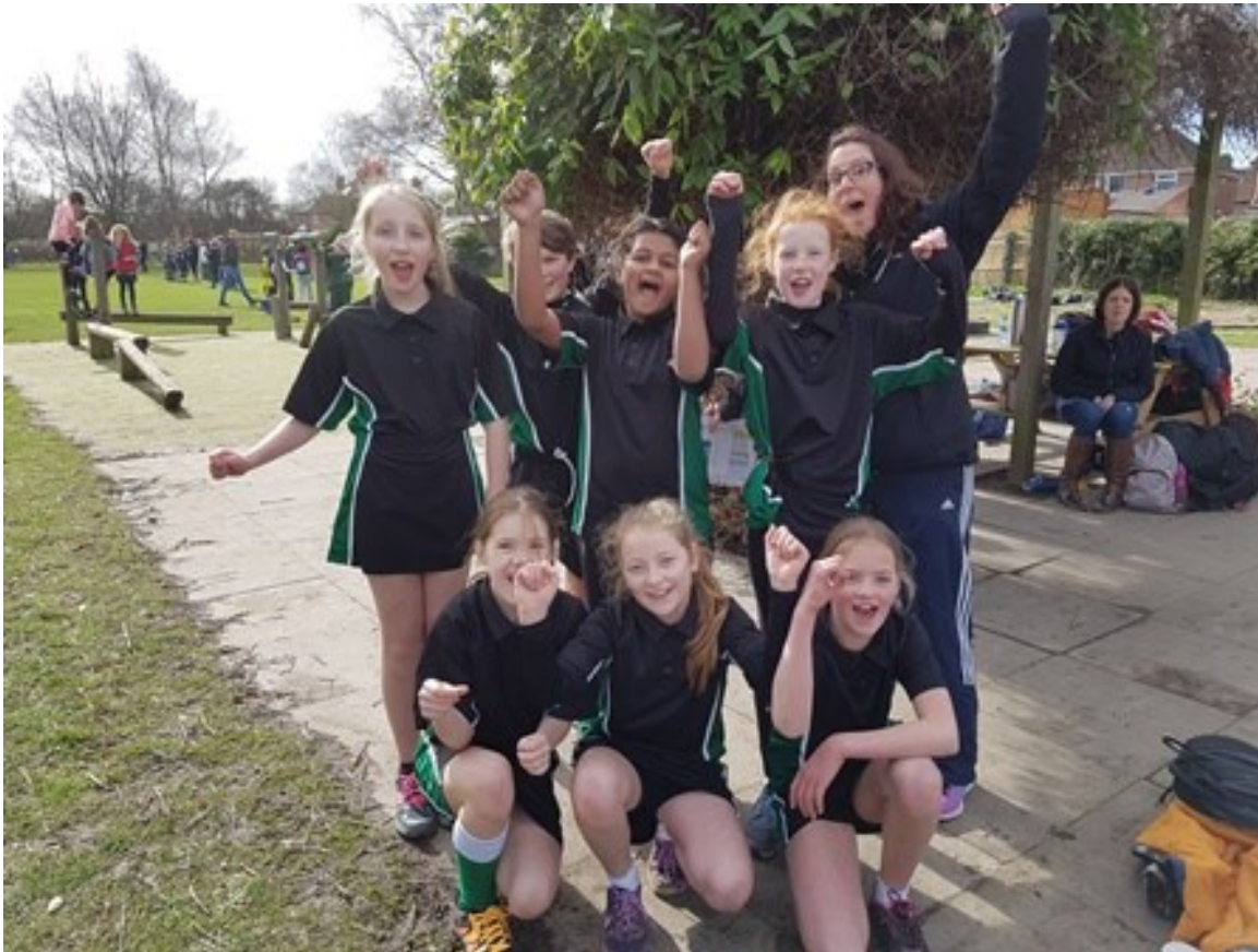
Year 5 and 6 Netball and Football teams at the Manor tournament