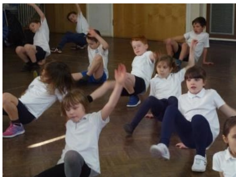
Street Dance in Year 3 with our visiting dance instructor