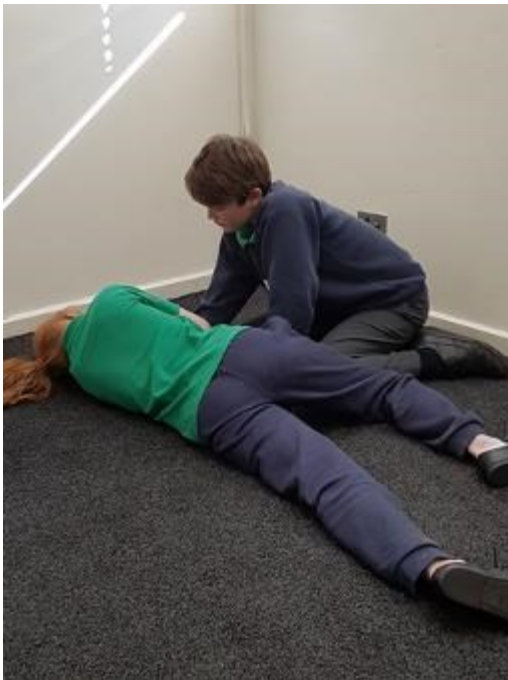
Year 6 Junior Citizen training